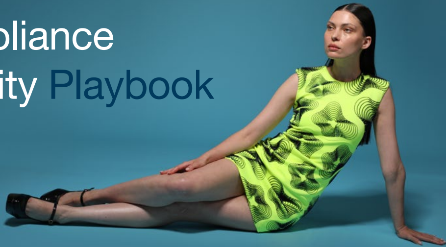
DIGI Dress by Karim Rashid in collaboration with STRATASYS