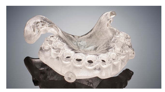
Figure 5. VeroGlaze, left, produces functional dental veneer try-ins, while Biocompatible, right, is approved for direct skin and short-term mucosal-membrane contact.