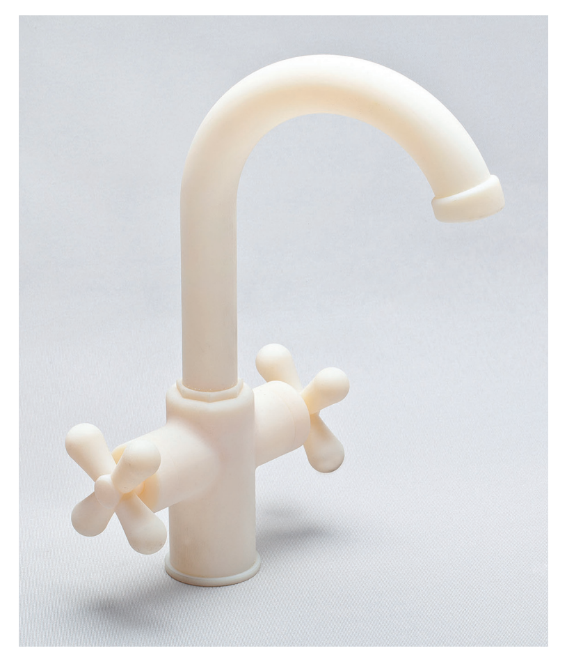
Figure 6. High Temperature material can withstand hot fluids.

High Temperature is a wise choice for functional testing with hot air or water, such as evaluations of plumbing fixtures and household appliances (Figure 6). Temperature resistance may also be a consideration for show pieces that will endure intense, hot lights. If temperature isn't a consideration, High Temperature may be a good choice for prototypes that need very high stiffness and strength.