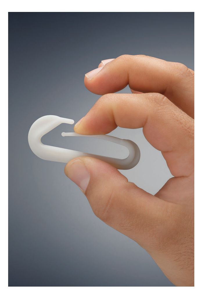
Figure 3. Rigur material was engineered for prototyping polypropylene products.

This PolyJet material has been formulated for improved dimensional and visual characteristics as well as greater strength. Parts made from Rigur are bright white (Figure 3) and have better surface finishes than Durus. This makes Rigur great for visual applications, and its higher temperature resistance (three times that of Durus) and strength (twice that of Durus) make it a good choice for form, fit and light functional testing of parts that will be produced in polypropylene.