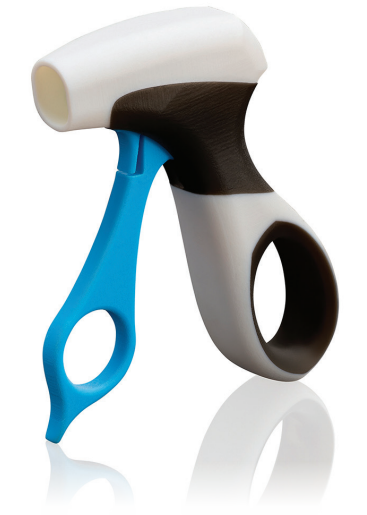
Figure 7. Digital ABS Plus features heavily in this design verification prototype for medical devices. This surgical prototype also features Agilus30 overmolding in black for superior grip and a 3D printed color handle, printed separately. Digital ABS Plus has heightened impact strength from Digital ABS, leading to improved functional performance.

Digital ABS Plus extends the simulation of engineering thermoplastics beyond the thermal resistance, toughness and transparency of High Temperature, Rigur and VeroClear. Digital ABS Plus is an advanced version of Digital ABS™, improving on the original material's impact strength. As its name indicates, this material closely approximates ABS. Compared with the averages for ABS<sup>1</sup>, Digital ABS Plus has the same or higher values for strength, flexibility, durability and heat resistance. Its impact resistance is below average for ABS<sup>1</sup> but still within the range of all ABS offerings, and more than three times that of Vero.