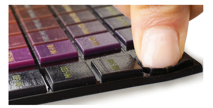
Figure 8. Various colors and Shore A values are displayed on this palette.

This range of rubber-like properties is unrivaled in the 3D printing industry. With it, designers and engineers can match the flexibility of production elastomers or test a number of slightly different options to find just the right feel (Figure 8).